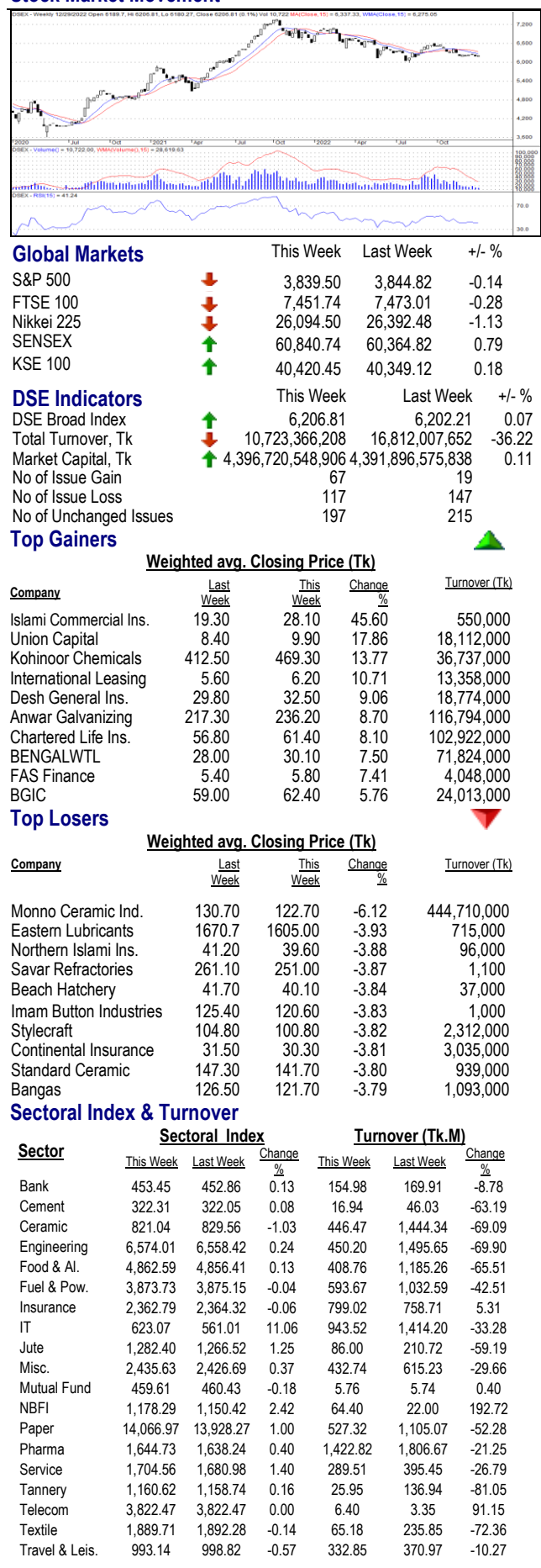
The week's data runs 22December 2022 to 29December 2022 Stock Market Movement