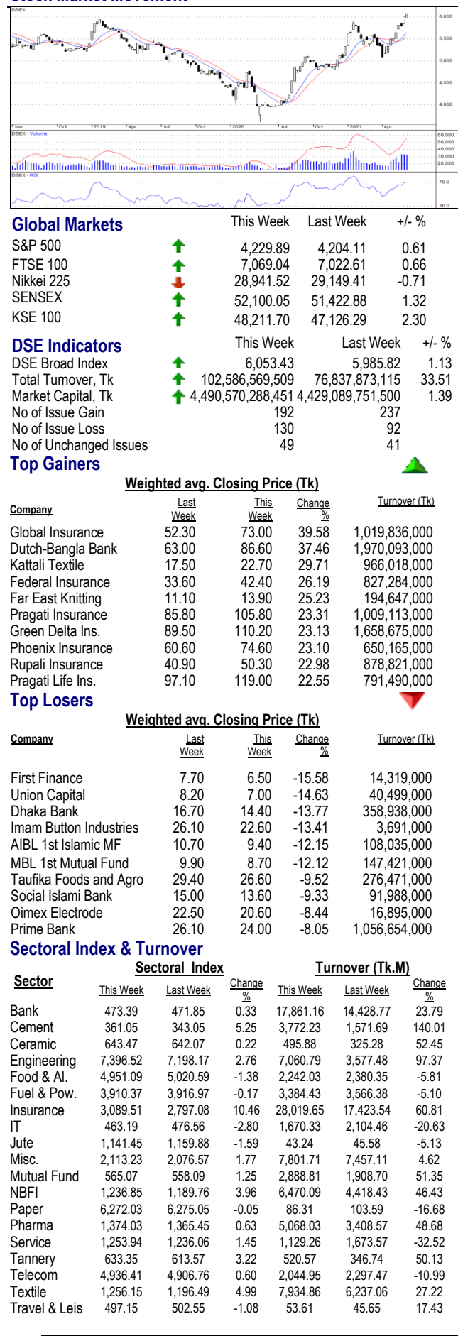
The week's data runs 27 May 2021 to 03 June 2021 Stock Market Movement